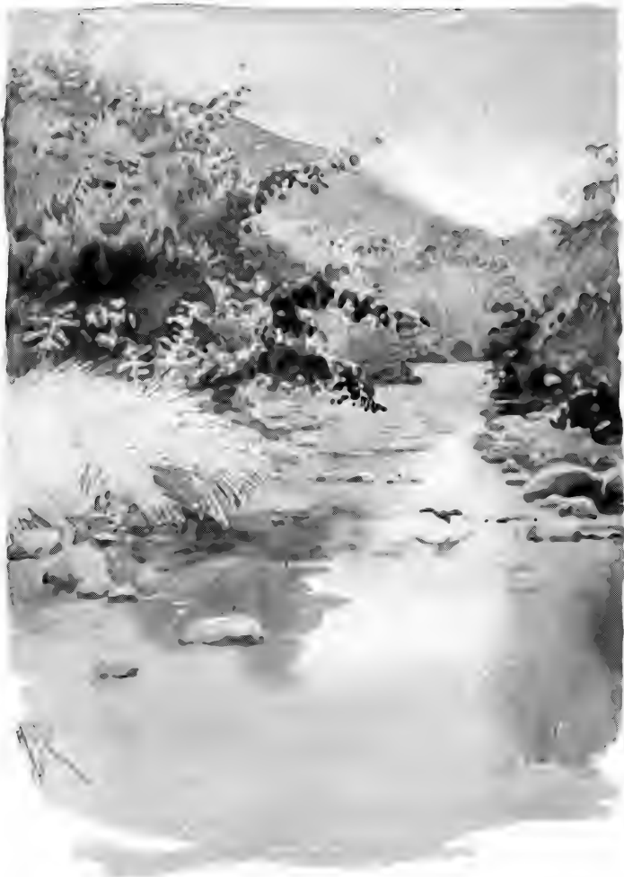
THE STREAMLET'S HUDDLING WATERS KISS THEIR BANKS.—Page 349.